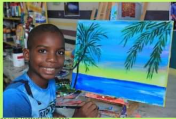
Made with PosterMyWall.com